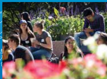
Main Campus, North Vancouver, B.C.

Source: Meteorological Service of Canada