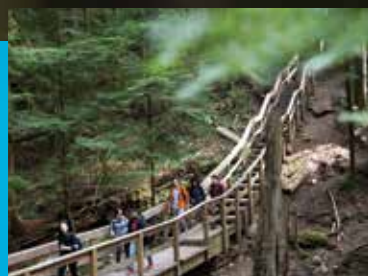
Baden Powell Trail, North Vancouver, B.C.