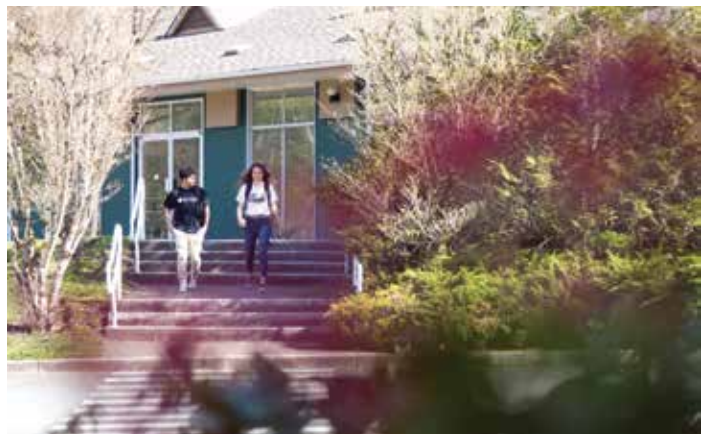
CapU Residence, North Vancouver, B.C.