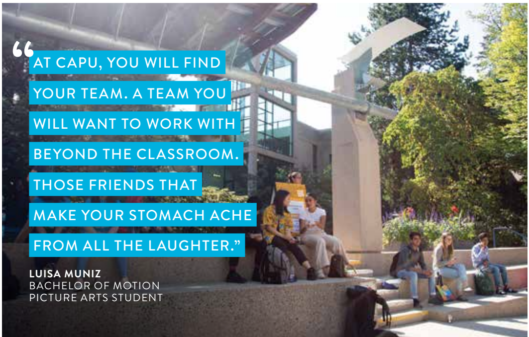
CapU Main Campus, North Vancouver, B.C.

If English is not your primary language, you must submit proof that you meet CapU's English Language Requirement. This is a requirement for all programs except if you start your studies at CapU with the English for Academic Purposes (EAP) program.